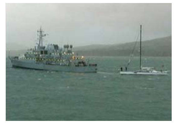
An Garda Síochána's involvement at MAOC(N) in Lisbon has yielded operational and intelligence results for Ireland and our European partners in combating the trans-Atlantic maritime trafficking of cocaine.

An Garda Síochána's first year of involvement at the Maritime Analysis Operations Centre – Narcotics MAOC(N) in Lisbon concluded in autumn 2009, yielding operational and intelligence results for Ireland and our European partners in combating the trans-Atlantic maritime trafficking of cocaine.