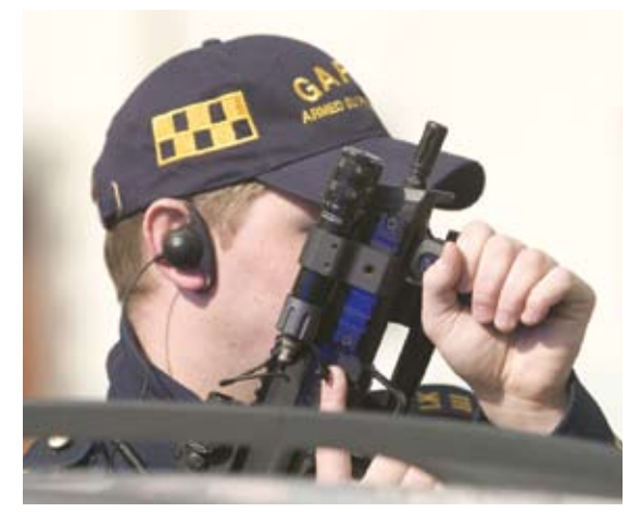
Garda Regional Support Units (RSU) provide effective support to frontline Gardaí in their response to critical incidents and serious crime.

RSU personnel are selected within their Garda regions on competency based criteria. Successful applicants must undergo 13 weeks intensive training in the Garda College. The training includes driving, firearms, tactics, first aid and critical incident management. During the tactical and critical incident segment of their training, RSU personnel receive guidance and training from the Emergency Response Unit (ERU).