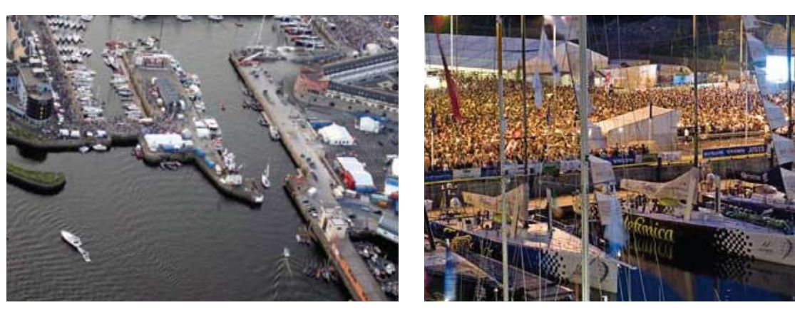
Over the course of two weeks, 650,000 people visited Galway and Salthill for the Volvo Ocean Race, breaking all attendance records of any stopover destination in the history of the race.

The policing of this event reflected very positively on the public image of An Garda Síochána. The "Lets do it Galway" committee's Global Economic Impact & Media Report commented that: "The success of the Galway Volvo Ocean Race Festival would not have been possible without the support of ... An Garda Síochána who ensured the safety & security of the event. They truly won the respect of all 650,000 people who attended.