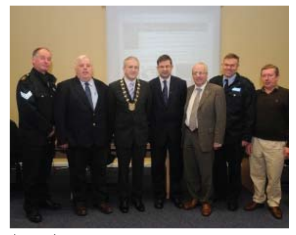
Éamon Ó Cúiv TD, Minister for Community, Rural and Gaeltacht Affairs (centre), launched the Cahircashelalert.com website, which includes information from 18 Community Alert schemes and 11 Neighbourhood Watch schemes.

The website also includes links to www.garda.ie and the Muintir Na Tíre website http://www.muintir.ie/ welcome.htm