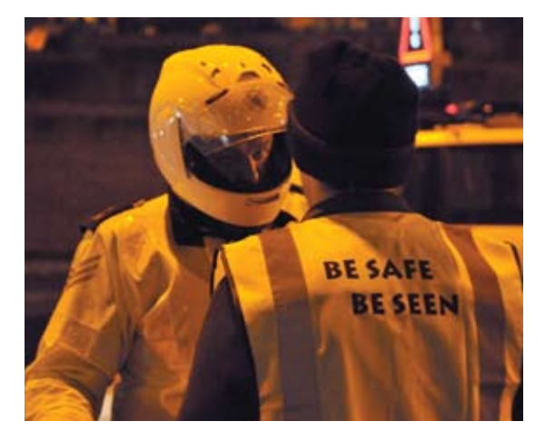
Operation Bicycle Lights saw a series of bicycle checkpoints mounted in a number of locations in Dublin in order to increase road safety awareness among cyclists and to correct any defects in their bicycles.

The programme is aimed at reducing the number of deaths and injuries which occur on our roads. Road safety is a regular feature on RTE's monthly Crimecall programme. The unit welcomes suggestions about topics of interest that could be covered on