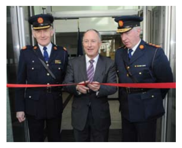
Pictured at the opening of Ballymun Garda station in January were (I-r): Assistant Commissioner Al McHugh, Dermot Ahern TD, Minister for Justice, Equality and Law Reform and Garda Commissioner Fachtna Murphy.

Gardaí in Terenure in Dublin devised Operation Switched On in 2009 to target the two high risk modes of travel which top the fatality risk on the streets of Dublin, namely pedestrians and people on two wheels (pedal /motorbikes). These two modes of travel significantly exceed the risk associated with