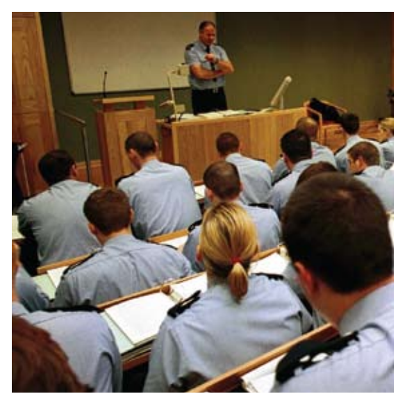
Training is developed and delivered during the year by the Strategic HR Unit.

Some 40 Gardaí received training in fraud investigations and first responders for IT crime, as part of a joint program between An Garda Síochána and the PSNI. The course has received accreditation from Limerick Institute of Technology, offering one third of the credit points for a Higher Certificate in IT Security and Investigative Techniques.