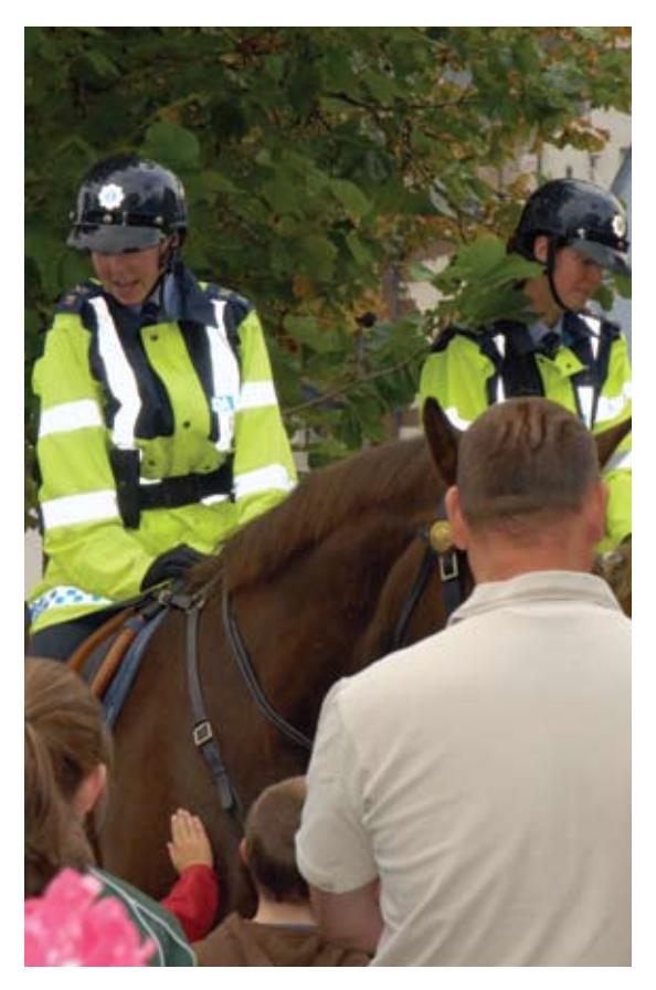
Members of the Garda Mounted Unit attended the Open Day at Wicklow Garda Station.

The units have been involved in several successful operations which resulted in arrests for robbery, burglary and theft. RSUs assist operational members in carrying out searches of dwellings, persons, and vehicles, in both armed and unarmed mode, depending on the circumstances. They have also been involved in several incidents where firearms have been used or threatened.